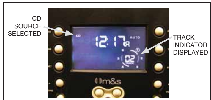
Figure 4. Master Unit CDTrack Indicator Display