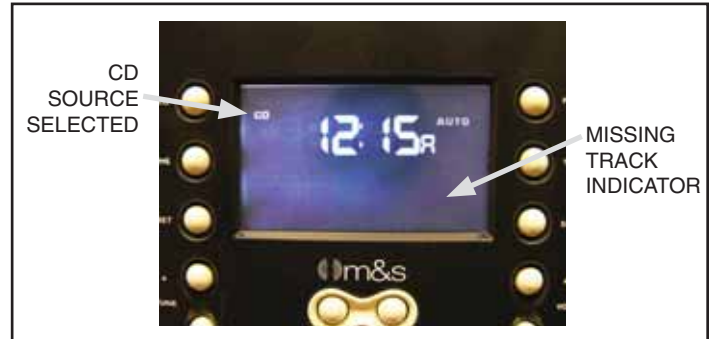
Figure 1. Master Unit Not Recognizing CD Unit