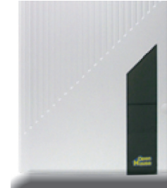
HD18/HD35 Hinged Door