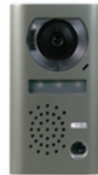
VMC1VDS Video Door Station