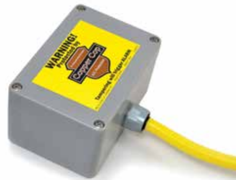
Copper Cop tamper-resistant alarm interconnect box

Linear's Copper Cop consists of a unique 30-foot cable harness with eight self-tapping screw-in clip assemblies, connected to a weatherproof alarm interconnect box. The system is ready to accept a wireless alarm transmitter or hard-wired connection to a security alarm panel. Once Copper Cop is installed on the exterior of the HVAC unit and activated, removal of the HVAC unit cover or tampering with the cable triggers an alarm.