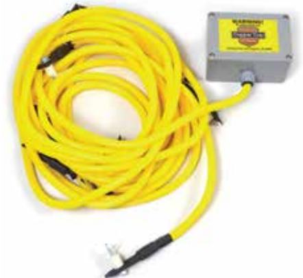
Copper Cop cable harness & interconnect box