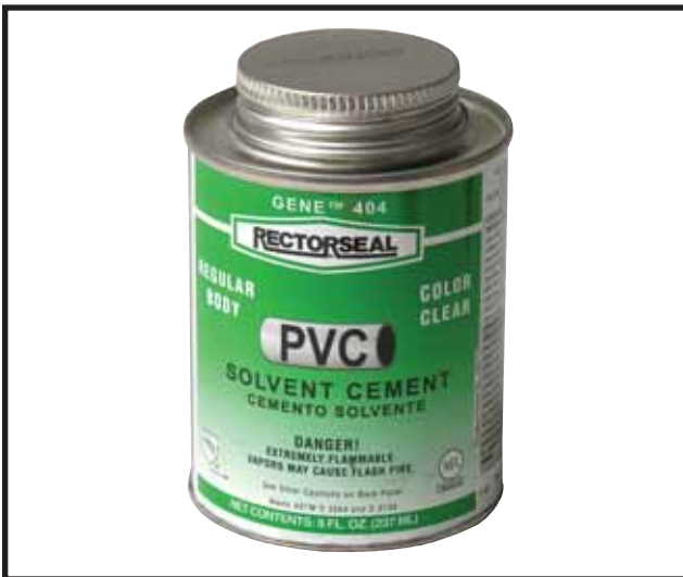
VM120-24 PVC CEMENT