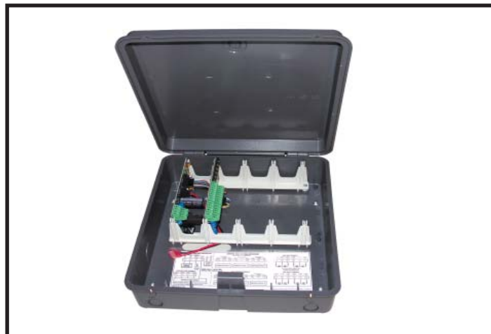
Model AM-MIO Input-Output Expansion Interface

Stock is sold out, and these products are no longer available.