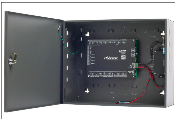
Standard Cabinet e3 eMerge Access Controller

Please contact your Linear Access & Integration team representative or your customer service representative if you have any questions at 800-421-1587.