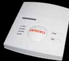
PERS-2400B Personal Emergency Reporting System