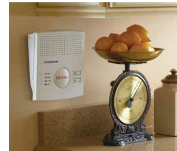
The PERS-2400B base unit can also be wall mounted