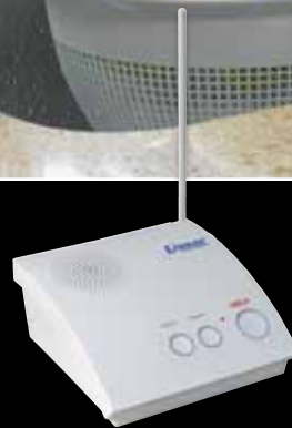
PERS-4200 Personal Emergency Reporting System