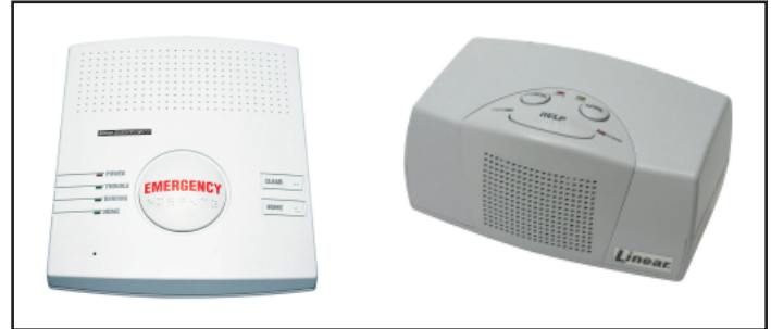
PERS-2400B and PERS-3600B Consoles

www.linearcorp.com/pdf/manuals/PERS-2400B.pdf www.linearcorp.com/pdf/manuals/PERS-3600B.pdf